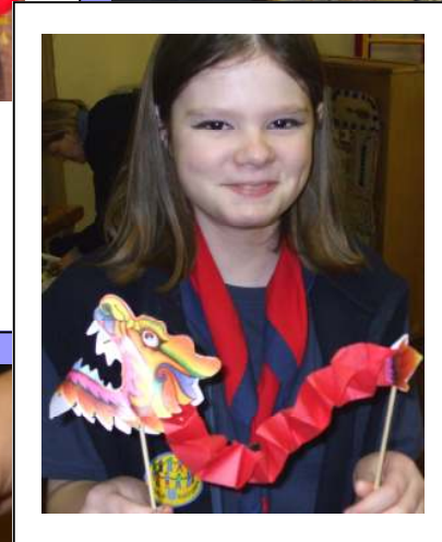
We dramatised the myth of Nian