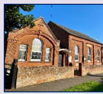
Methodist Chapel Stone