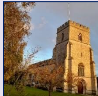
St Peter & St Paul Dinton