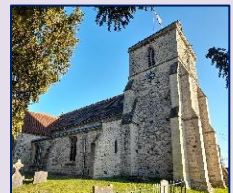
St John the Baptist Stone