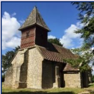
St Michael & All Angels Aston Sandford