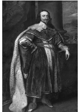
King Charles I