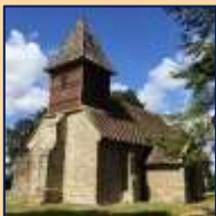
St Michael & All Angels Aston Sandford