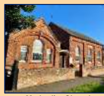
Methodist Chapel Stone