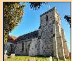
St John the Baptist Stone