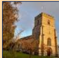
St Peter & St Paul Dinton