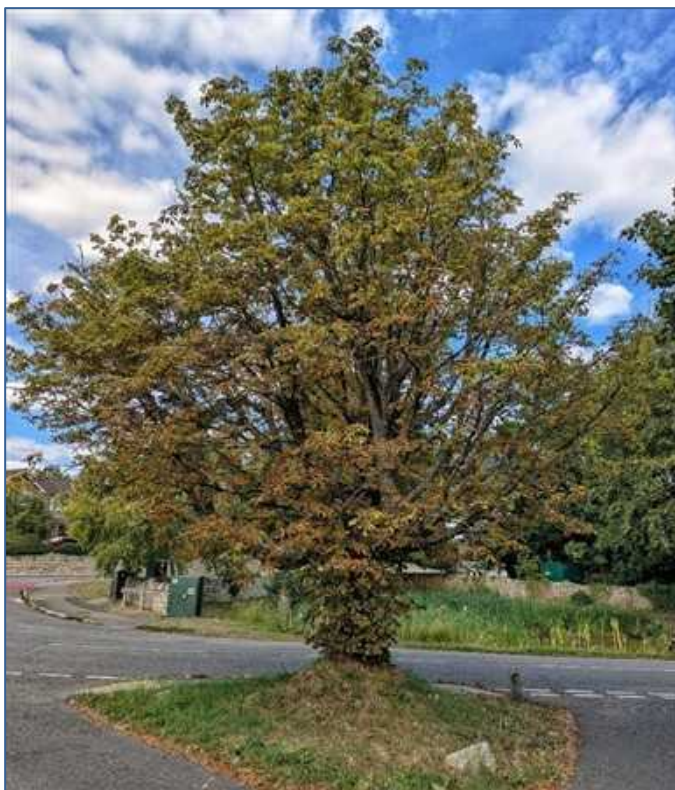
The diseased chestnut tree at the Bishopstone Road junction before felling.

There have been stories about the game being banned. In the early 2000s, a myth sprang up that the Health and Safety Executive (HSE) had banned conker fights. The HSE was even forced to put a denial on its website, external, describing the story as, "an old chestnut".