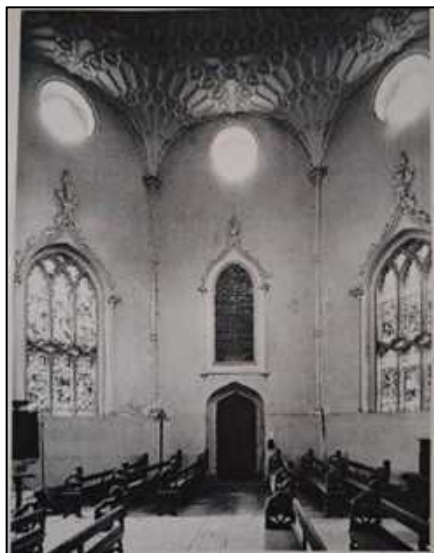
Inside Hartwell Church 1943

In 1956 there was a partial collapse of the building. On 21 December 1967 it was designated as a Grade II* listed building. Grade II* listing means that it is considered to be a particularly important building of more than special interest. The church was declared redundant on 23 March 1973, and was vested in the Churches Conservation Trust on 27 July 1975. When the Trust took over the church it was in poor condition and without a roof. In 2000 repairs were carried out, which included rebuilding the roof in its original design using Westmorland slate, repairing the roof of the east tower, and repairing some of the stonework on the exterior of the church.